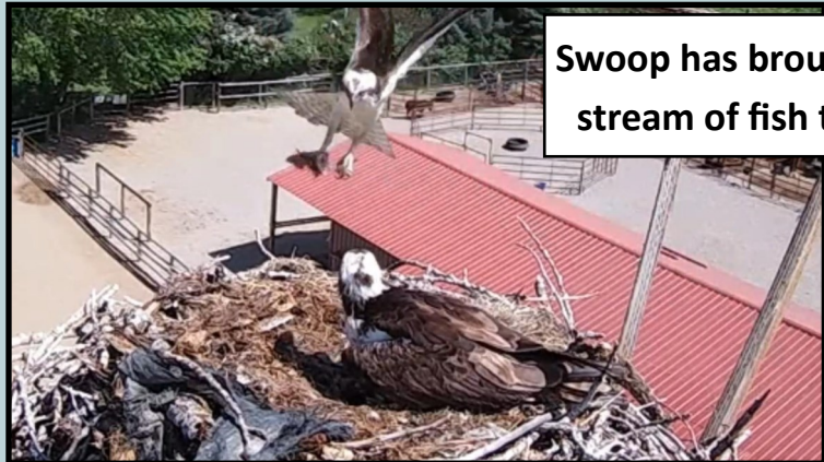
Swoop has brought a steady stream of fish to the nest.