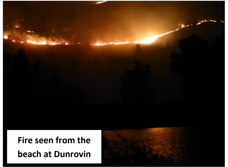
Fire seen from the beach at Dunrovin

Just after dark on September 15, 2013 lightning struck in the Sapphire Mountains immediately across the Bitterroot River from Dunrovin. It had been a hot and dry summer and the wind was roaring that day, so conditions were right for a fast-moving fire. The fire quickly spread and threatened to jump the river to put Dunrovin in its path. Dunrovin moved all the horses away and set the irrigation system to spray water over the buildings that were fully occupied with guests. About 2am, the wind calmed down and light rain began to fall, ending the emergency for Dunrovin. The next day, everyone watched via the webcams as officials used helicopters to scoop up water from the river to douse the last of the fire.